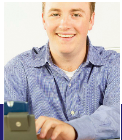
Copyright. 2007 YouGov and Centaur Media Plc, publishers of Employee Benefits. No copies or part copies of this document shall be made without joint permission of YouGov and Employee Benefits.

Those employers which deliver will find they have a much happier, motivated and committed workforce on their hands and are more likely to reap productivity gains.